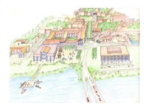
Entrée en ville-capitale