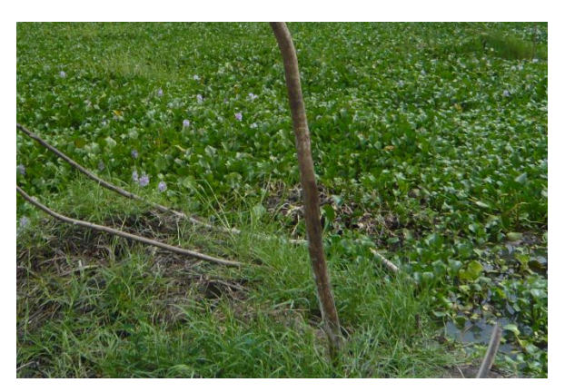
Invasion of the water hyacynths NGO in charge of the waste collection dumping their load in the Zounvi area.