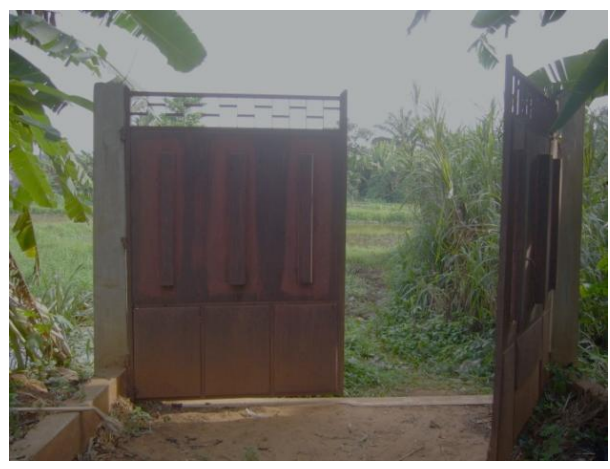
Donoukin : Ruins of a house