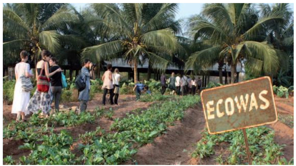
Tour of the Songhaï Centre by the workshop's participants in 2010.

The Songaï Centre is located in the Zounvi natural depression. It is a centre for training, production, research, development based on integrated farming. It is an experimental agri-organic centre which method is based on the exploitation of the cultivated areas' own ressources. The Songaï experimentations started on one hectare of forsakened land, given by the government. Since then, the land has become the centre's headquarters and its first « farm-school ». It is 15 hectares wide and is one of the most productive farm of the region.