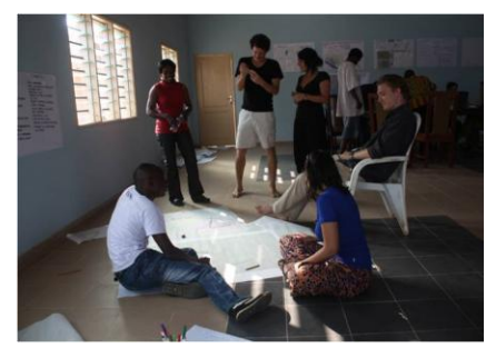
A day in the workshop