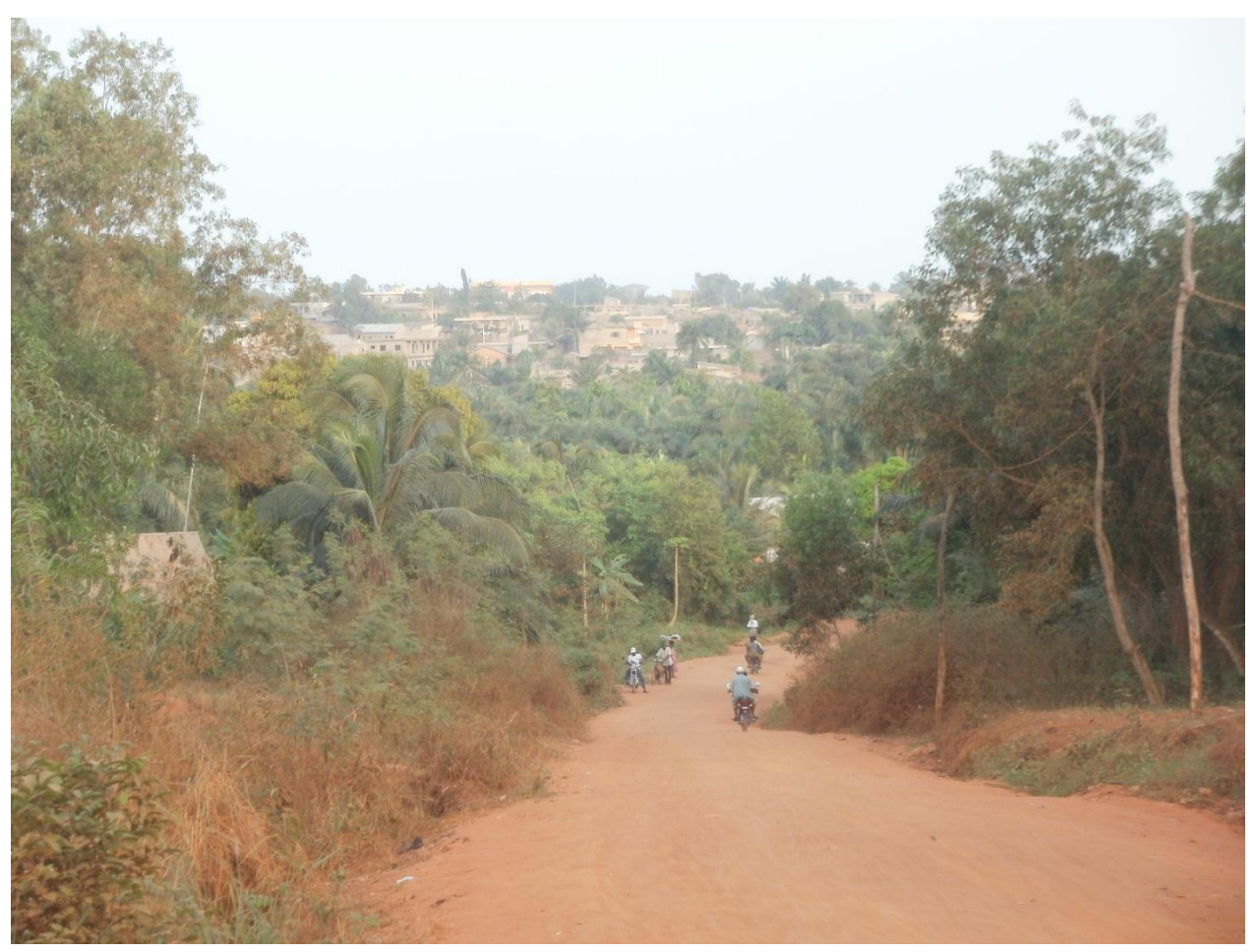
A road in Boué, after the RNIE 2 (towards the Ouando Market) )

Principe d'équilibre entre trame verte et bâti