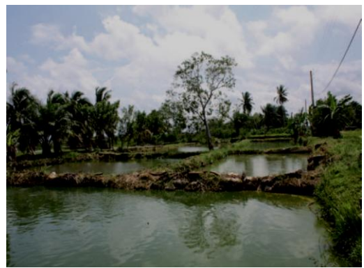
Fish farming in Boué.

Generally, the depressions are not or poorly exploited in Porto-Novo. There are some farming exploitations: fish farming, tree nurseries, market gardening... The planning project for the depressions need to maintain these existing activities and develop other activities in order to create economic and social benefits.