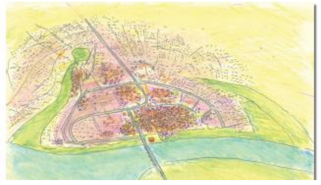
Sketch produced during the 2009 workshop focusing on the West bank of Porto Novo's lagoon..

Since 2010 Porto Novo has developed its own cycle of International urban planning workshops for students and young professionals, with the support of Les Ateliers: This year, the goal is to confirm the West-African Urban Planning Workshops' sustainability. This third session will focus on the importance of the ecosystem for Porto-Novo's urban development.