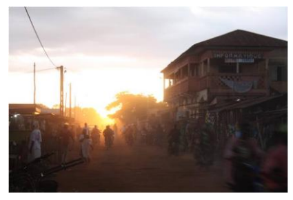
In the street