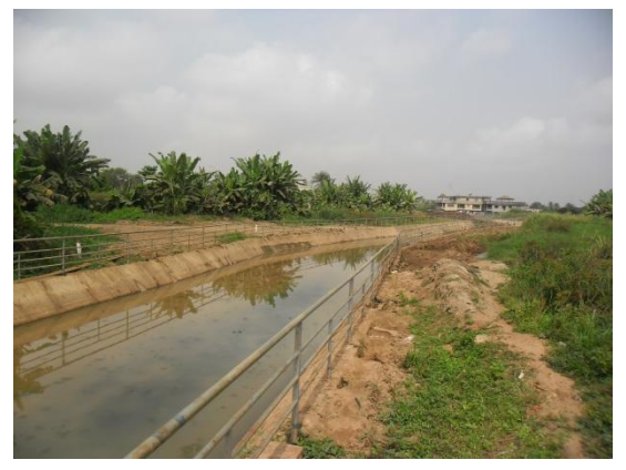
The branch of the G collector crosses the Donoukin and drain the city's rain and waste water.

Generally, the depressions are not or poorly exploited in Porto-Novo. There are some farming exploitations: fish farming, tree nurseries, market gardening... The planning project for the depressions need to maintain these existing activities and develop other activities in order to create economic and social benefits.