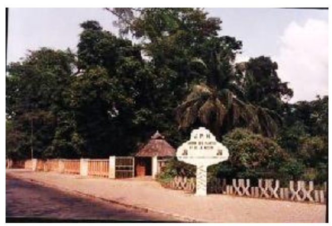
The Botanical and Nature Garden.

The garden is a witness of the former kingdom of Porto Novo. It fulfils many needs for the population: regulating the air quality, resting area, provider of medicinal and culinary herbs as well as seeds that were introduced many years ago. It is a tremendous educational tool for the knowledge of the local ecosystem, for the awareness and the education to a better management of the environment. The JPN has an important wealth potential and its point of interests are almost unlimited for the city.