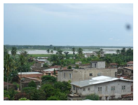
View of the lagoon