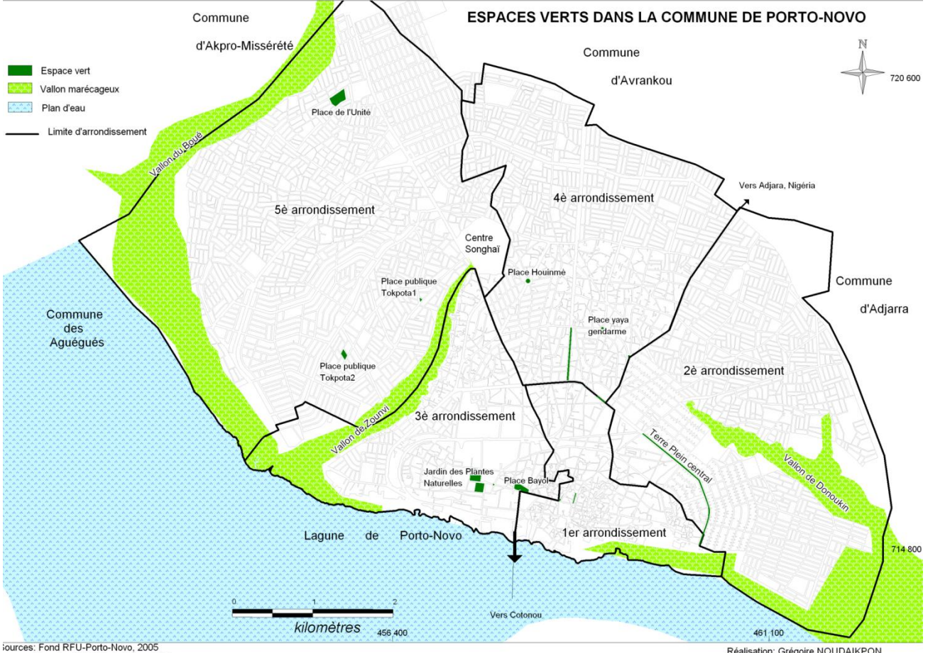
Données DST-Porto-Novo, 2009

How to preserve, protect, plan and promote the different depressions (Zounvi, Donoukin and Boué) of Porto-Novo and create integrated ecological areas on the one hand, and on the other hand, create farming, tourism and leisure areas?