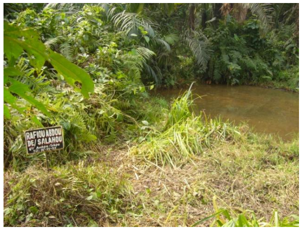
Zounvi: A private lot in the depression

Because of housing estate projects, many owners have been relocated along the banks and in areas which are not suitable according to the 7<sup>th</sup> February 1992 government decision n° 2 MEHU/DC/DUA. This decision states that a 100m area from the highest water limit is property of the state and is unconstructible.