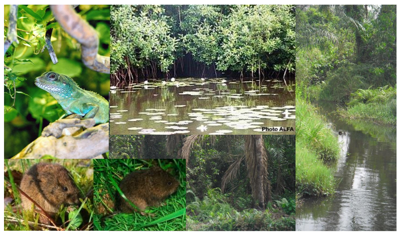
Ecosystms of Porto-Novo's depressions.