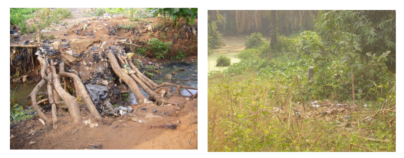
Donoukin: Makeshift bridge to cross the stream.

Because of housing estate projects, many owners have been relocated along the banks and in areas which are not suitable according to the 7<sup>th</sup> February 1992 government decision n° 2 MEHU/DC/DUA. This decision states that a 100m area from the highest water limit is property of the state and is unconstructible.